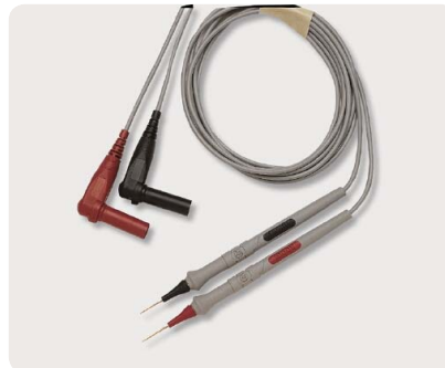
34133A Precision Electronics Test Leads