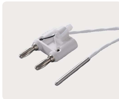
E2308A Thermistor Probe