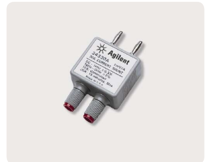
34330A 30A Current Shunt